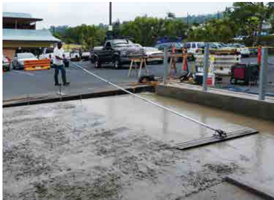
First-pass consolidation (i.e. float) of surface after screeding but before checking the surface with a digital level mag screed.

various levels of checks. The 0.6-m (2-ft) long level should have 19-mm (¾-in.) square engineered poly feet set 76 mm (3 in.) in from each end, mounted on the rail side of the level that touches the form or finished surface. This way, it takes samples at 457 mm (18 in.) without rocking on small particles on the surface off the forms or other surfaces.