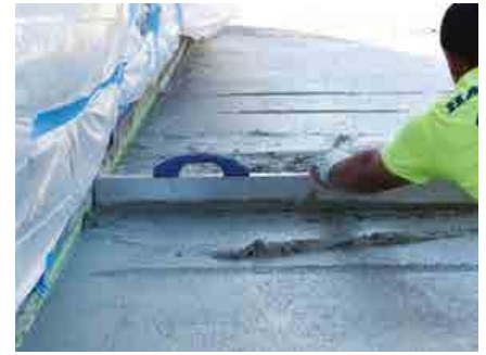
Initial screeding: third-phase bump-cutting dredging method to get cross-slope lower than 2.5 percent.