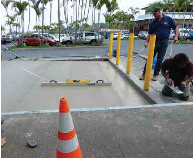
Checking plastic surface with digital level mounted on a 1.8-m (6-ft) mag screed over large areas in 0.9-m (3-ft) grids.

coefficient of friction (COF) must be a minimum of 0.5 to meet the standard. The number recommended by the U.S. Access Board is 0.6 for the < 2.1 to five percent sloped surfaces and 0.8 for ramped surfaces up to 8.3 percent. 8 Under ASTM D2047, broomed concrete surfaces are usually 1.0 COF. 9