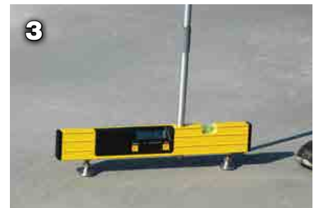
The final check of a cured surface using a walking digital profiler. Image 1 shows the lift, Image 2 illustrates the twist and rotate on one foot of the device, and Image 3 shows the final placement (i.e. both feet down) to read the slope. By twisting the knob on the handle, the articulating feet rotate to walk the measurements continuously in 300-mm (12-in.) increments. Readings or samples are taken at every other 300-mm turn—in other words, they are collected at 600-mm (24-in.) increments.