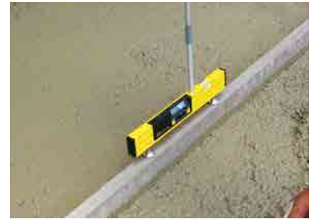
Demonstrating the reliability between a level directly on the concrete and mounted on the mag beam, a walking 300-mm (12-in.) profiler on articulating feet, and a walking profiler used on a mag screed to check the first cut.