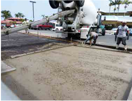
Initial screeding: forms set to buffer factor slope of \pm one percent.