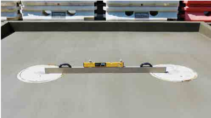
The top photo shows open site conditions and matching manhole covers placed as the same slope and elevation as the forms for the adjacent parking stall surface. The bottom photo depicts the seamless-finish manhole covers within the concrete parking space that meets the Americans with Disabilities Act's (ADA's) < 2.1 percent in any direction at any point within the entire surface.

Ensuring a predictably flat concrete floor does not require special admixtures or stiff slumps. It is perfectly acceptable to use 2500- to 3500-psi (or other specified psi) concrete mix at 114-mm (4.5-in.) slump, but with aggregate rocks 19 mm (¾ in.) minus. Larger aggregate could lead to 'tip ups' that then require pressing the concrete surface down to work back the rock, deforming the surface. Similarly, one can use standard industry placement techniques with some minor, but consistently applied, ADA flatness tweaks.