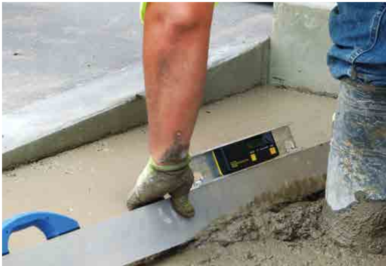
Initial screeding: second-phase bump-cutting using a digital level mounted on a mag beam screed.